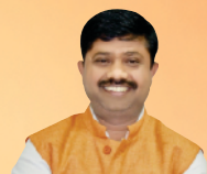
Nand Gopal Gupta 'Nandi' Minister of Industrial Development Uttar Pradesh