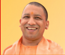
Yogi Adityanath Chief Minister, Uttar Pradesh